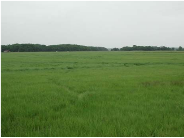
An eastward view of Island Road Marsh