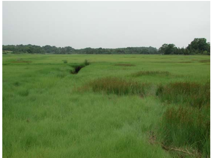
A westward view of Island Road Marsh

Island Road, located in Essex, Massachusetts, is a causeway dividing an area of high marsh between the mainland and an island. Unlike most areas where there is a unidirectional tidal flow, both sides of the causeway receive tidal waters though there is considerably greater flow from the Essex River side. Under normal conditions, this greater flow of water would simply flow over the marsh to the other side, but the causeway has created a barrier to such movement. Two culverts were installed in the early 1900's to prevent flooding on the road and promote tidal exchange. Both, however, are undersized and severely limit the amount of tidal exchange between the two sides. In addition, the north culvert has collapsed allowing tidal flows to undercut the road and washing eroded sediment from the road into the creek. The undersized culvert and buildup of eroded sediments is having a profound effect on the salt marsh and tidal creeks. The tidal restriction has led to decreased salinity levels favoring the spread of invasive vegetation such as purple loosestrife ( Lythrum salicaria ), poison ivy ( Toxicodendron radicans ), pasture rose ( Rosa carolina ) and hedge bindweed ( Calystegia sepium ), which displace native salt marsh vegetation such as salt marsh hay ( Spartina patens ), black grass ( Juncus gerardii ) and spike grass ( Distichlis spicata ). Changes in vegetation have diminished the habitat value of the marsh for use by fish and other estuarine species.